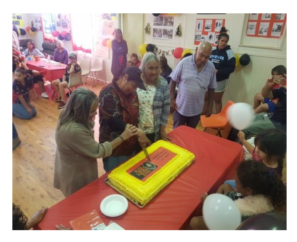
Elders cutting the NAIDOC cake