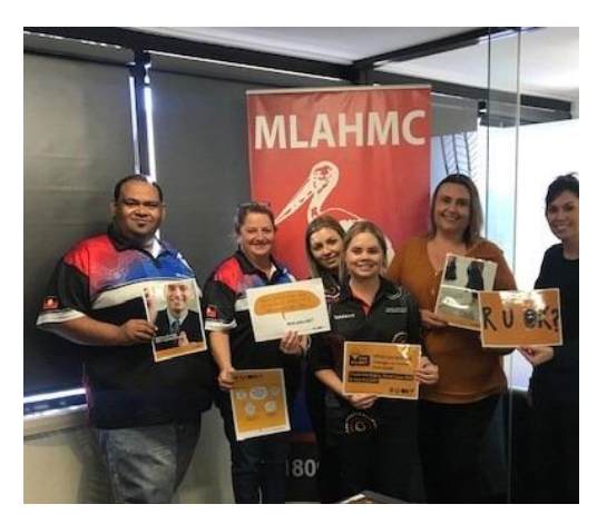
MLAHMC Staff Supporting 'R U OK' Day for suicide prevention