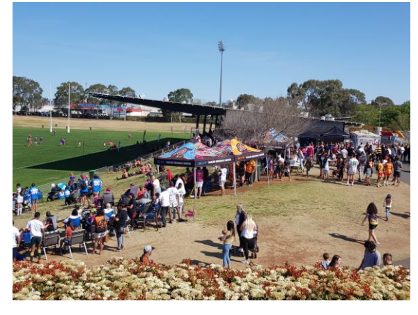
Snapshot of players and supporters

We would like to thank the 'Dubbo Waratah's Sports Aboriginal Corporation' for facilitating such a great event, we look forward to next year's KO!