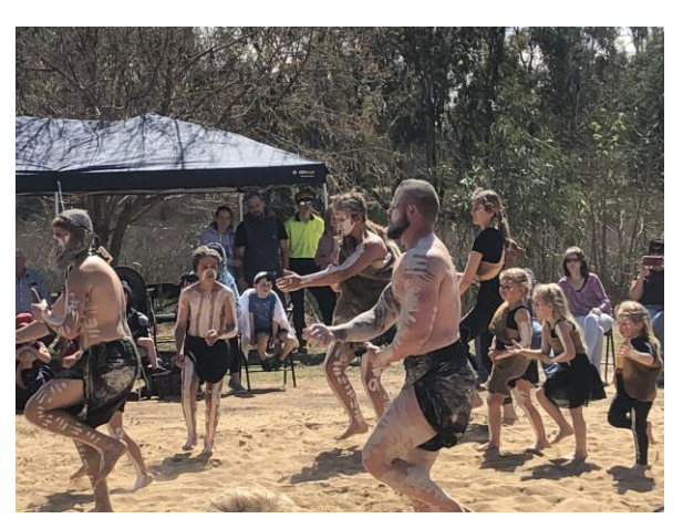
Traditional Dancers at the Forbes NAIDOC event