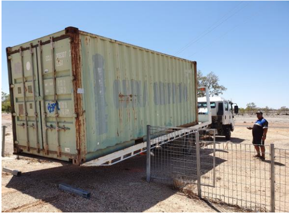
MLAHMC staff assisting in a 'Clean up' in Goodooga