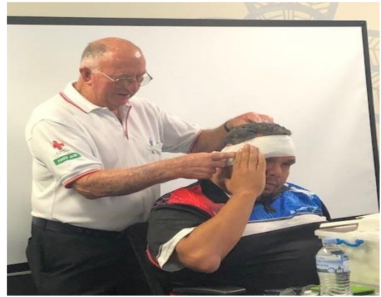
MLAHMC Staff completing First Aid Training